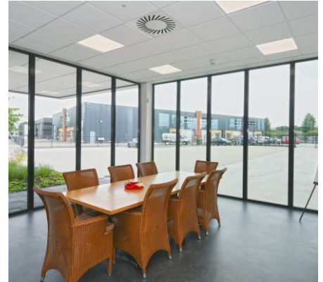
The PANEL PERFORMANCE luminaire with optimized color consistency.

After the lighting plan was created by Van Egmond Groep and LEDVANCE and the new luminaires were installed by Servex B.V. itself, the company is very satisfied with the lighting results. All spaces of the business building are equipped with an energy-efficient lighting solution that is perfect for the specific area.