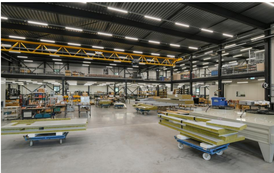
The LEDVANCE DAMP PROOF Gen 2 luminaire provides uniform light with a wide beam angle.