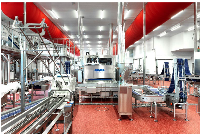
Bright and pleasantly lit for maximum employee safety

in the food industry and at the same time significantly reduce energy consumption and maintenance costs.