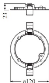
LDVAL SlimDL TRI RD 40