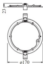
LDVAL SlimDL TRI RD 60