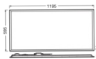
LDVAL PL0312B TRI