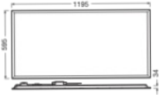
LDVAL PL0612B TRI