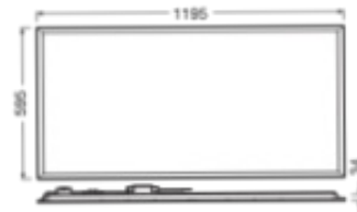
LDVAL PL0612B TRI